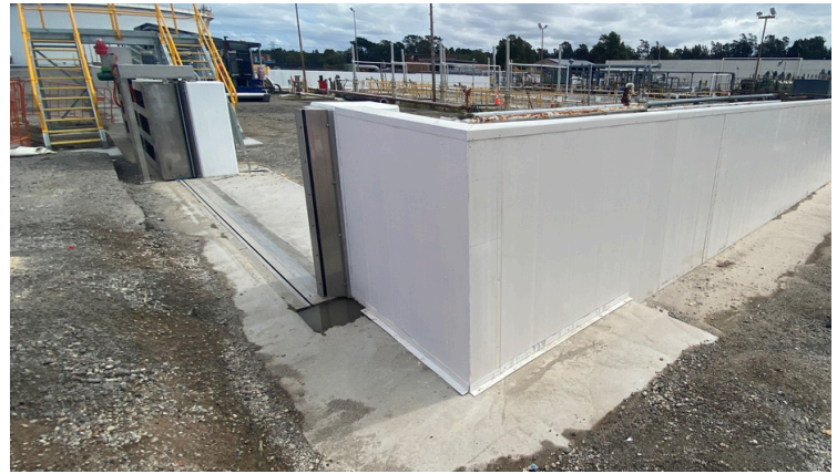
Levee wall and flood gate surrounding the Waste Water Treatment Plant

Construction of the new western stormwater water pump station is progressing, whilst the new eastern stormwater pump station is still awaiting external approval.