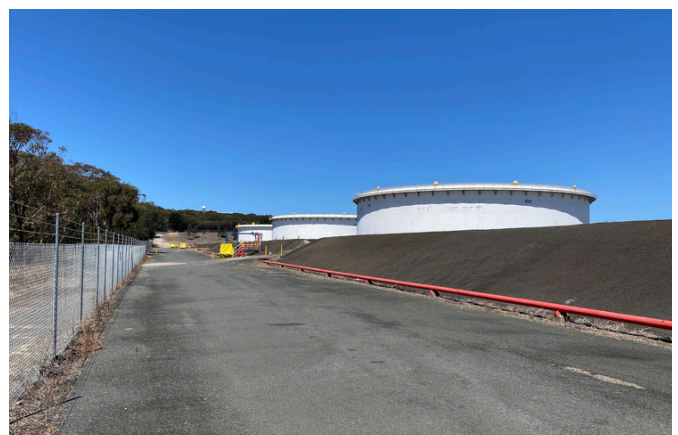
North east corner of the Terminal

Delivery of additional odour extraction units and neutralising controls is expected in early November.